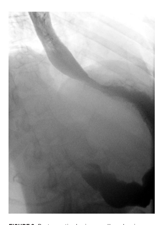
FIGURE 3. Postoperative barium swallow showing effective myotomy and decreased esophageal diameter. The barium passes freely through the lower esophageal sphincter into the stomach, confirming the relief of the obstruction.

Immediately after the POEM procedure, the patient was able to swallow normally, and the postoperative swallow study showed barium passing freely through the lower esophageal sphincter into the stomach, confirming the relief of the obstruction (Figure 3). She was discharged home the next day.