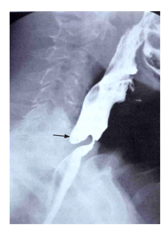
FIGURE 1. A typical barium swallow demonstrating a cervical (Zenker's) diverticulum. Arrow points to the diverticulum extending from the esophagus.

Zenker's diverticulum is an "outpouching" that occurs in a typical location in the cervical esophagus. Symptoms secondary to a cervical