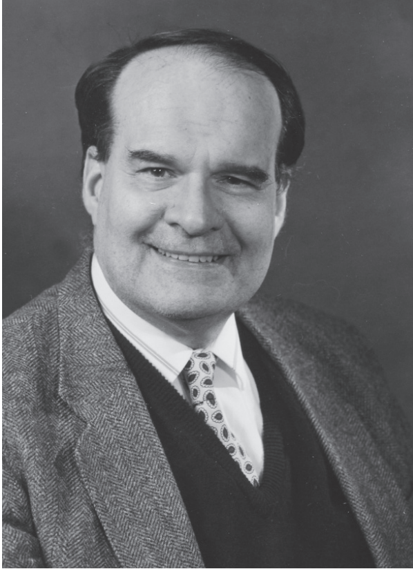
Figure 18.5 Martin Charles Mihm Jr.

and deposition of fibrin in the dermis as characteristic of delayed-type hypersensitivity (11).